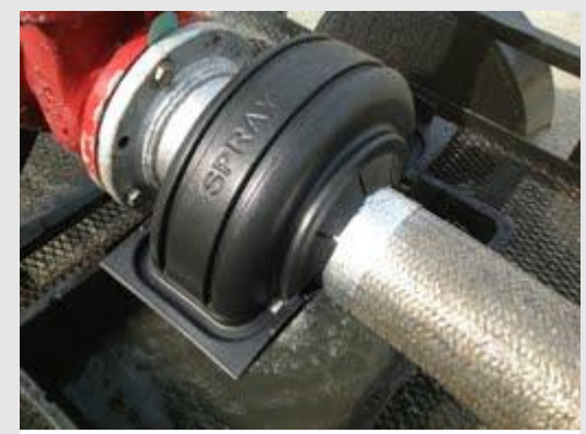
Figure 2: In service

The Sprayproof product is designed with simplicity in mind. Because of its unique design, it requires no special training or even installation instructions for use. To install, simply place the Sprayproof around the area to be protected and snap the tab inside the female receiver. When the latch snaps, the part is installed and ready for use. It cannot be installed incorrectly. No adjusting or checking is needed for a precise fit. If it snaps, it's installed correctly. This is far superior to the installation of any competitors' products such as duct tape or cloth wraps.