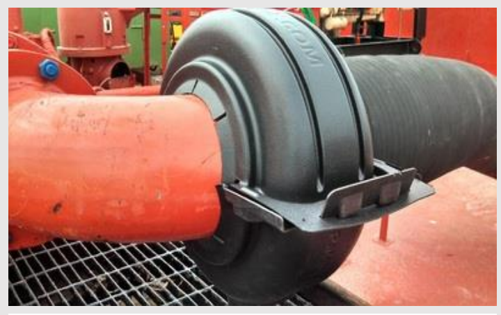
Figure 1: Sprayproof patented design

These leaks develop from pipe corrosion, gasket failure, seal failure, mechanical failure, and excessive pressure and, of course, human error. It is excellent protection in crucial areas where spray or leaks could